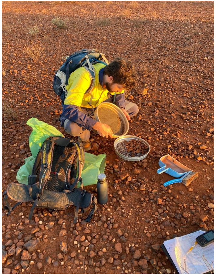
Figure 2. Cazaly's Project Geologist collecting lag samples at Yabby.

Cazaly's MD Tara French commented "To date, the initial work at Yabby indicates we have a number of mineralised gold trends likely to be shear hosted. This current phase of surface sampling should refine surface geochemical anomalies to prioritise drill worthy targets."